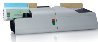
Automatic letter openers

At Neopost our mission is to help businesses meet the increasing challenge of controlling costs and maximising productivity. Make your mail faster, cheaper and more efficient with Neopost, the UK's No.1 Supplier of Franking Machines and mailing solutions.